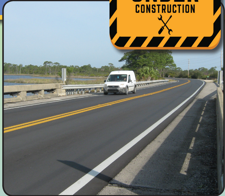
Existing Western Lake Bridge