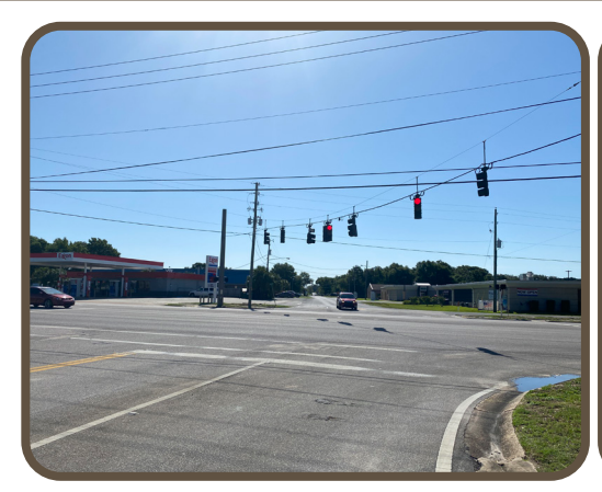
Eglin Parkway at Erwin Fleet Road