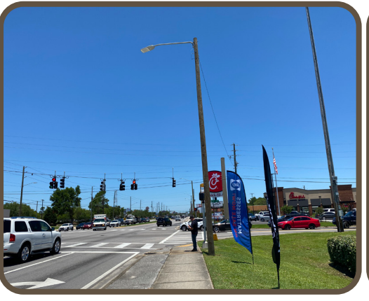
Beal Parkway at Lewis Street