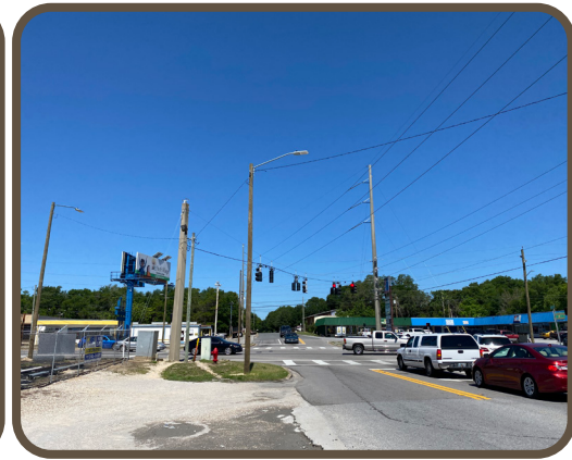
Beal Parkway at Pelham Road